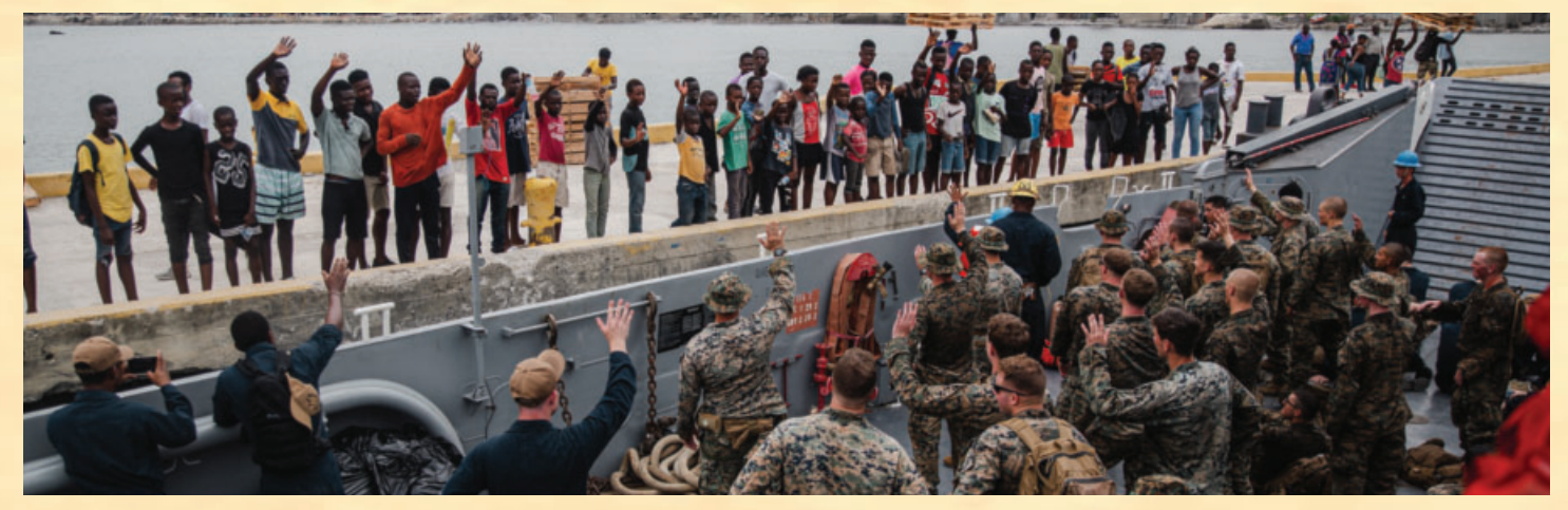
U.S. Marines and Sailors with Joint Task Force-Haiti wave to locals after helping offload boxes for redistribution in Port of Jeremie, Haiti, Aug. 31, 2021. The Marines and Sailors aboard the USS Arlington (LPD 24) have been working in support of JTF-Haiti for a humanitarian assistance and disaster relief mission.

Relationships built through training and shared relief efforts ensure that the U.S. is the partner of choice in the hemisphere.