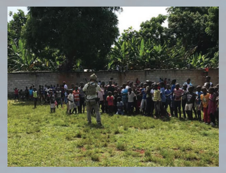
A Special Tactics operator greets Haitian citizens as he secures the area for a delivery of humanitarian aid supplies as part of Joint Task Force-Haiti. Special Tactics Airmen responded to a request to augment relief efforts in Haiti after a 7.2 magnitude earthquake hit the country Aug. 14, 2021.

at that survey site to coordinate with JTF-Haiti, the aircrew and work with the NGO to find the exact location of those patients and evacuate them to a higher level of care."