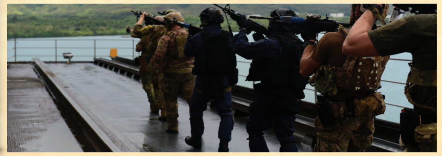
U.S. Naval Special Warfare operators and Japan Maritime Self-Defense Force sailors conduct a simulated visit, board, search, and seizure of USS Frank Cable (AS-40) as part of MALABAR 2021. MALABAR 2021 is an example of the enduring partnership between Australian, Indian, Japanese and American maritime forces, who routinely operate together in the Indo-Pacific, fostering a cooperative approach toward regional security and stability.

NSW is the nation's premier maritime Special Operations Force and is uniquely positioned to extend the fleet's reach and deliver all-domain options for multinational