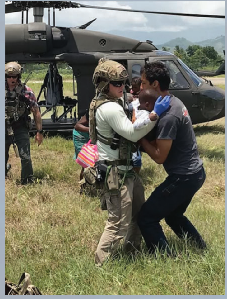
U.S. Air Force Special Tactics operators prepare to hand off an injured patient after an emergency medical evacuation in the western part of Haiti. Special Tactics Airmen responded to a request to augment Joint Task Force-Haiti relief efforts after a 7.2 magnitude earthquake hit the country Aug. 14, 2021.

"While we were conducting our survey at Les Cayes,