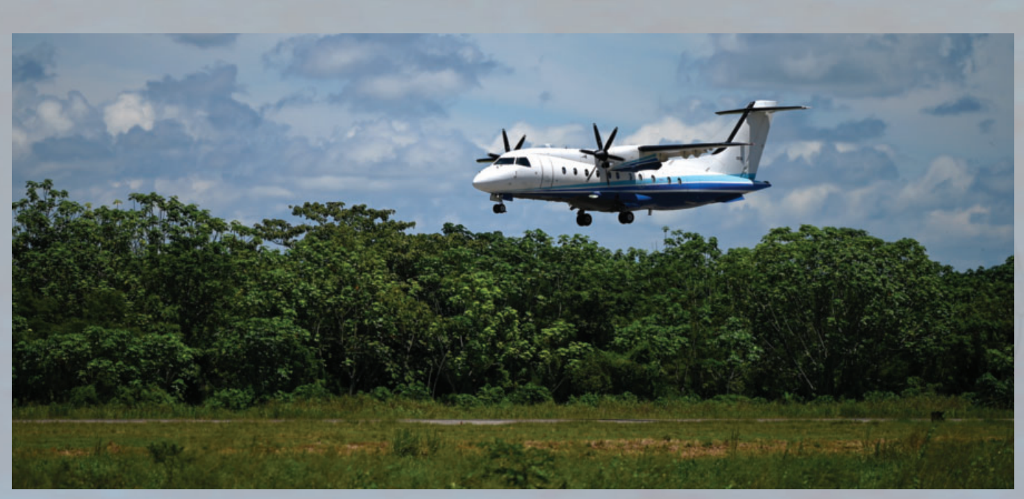
A U.S. Air Force Special Operations Command C-146A Wolfhound assigned to the 492nd Special Operations Wing lands in order to deliver simulated casualties evacuated from an exercise disaster zone Sept. 2, 2021, during Ángel de los Andes Cooperación VII in Rionegro, Colombia. Ángel de los Andes is a Colombian-led search and rescue exercise, while Cooperación VII is a multinational humanitarian aid and disaster response exercise.

assistance event might entail and served as an opportunity to identify what works well and where we could integrate more effectively in the future."