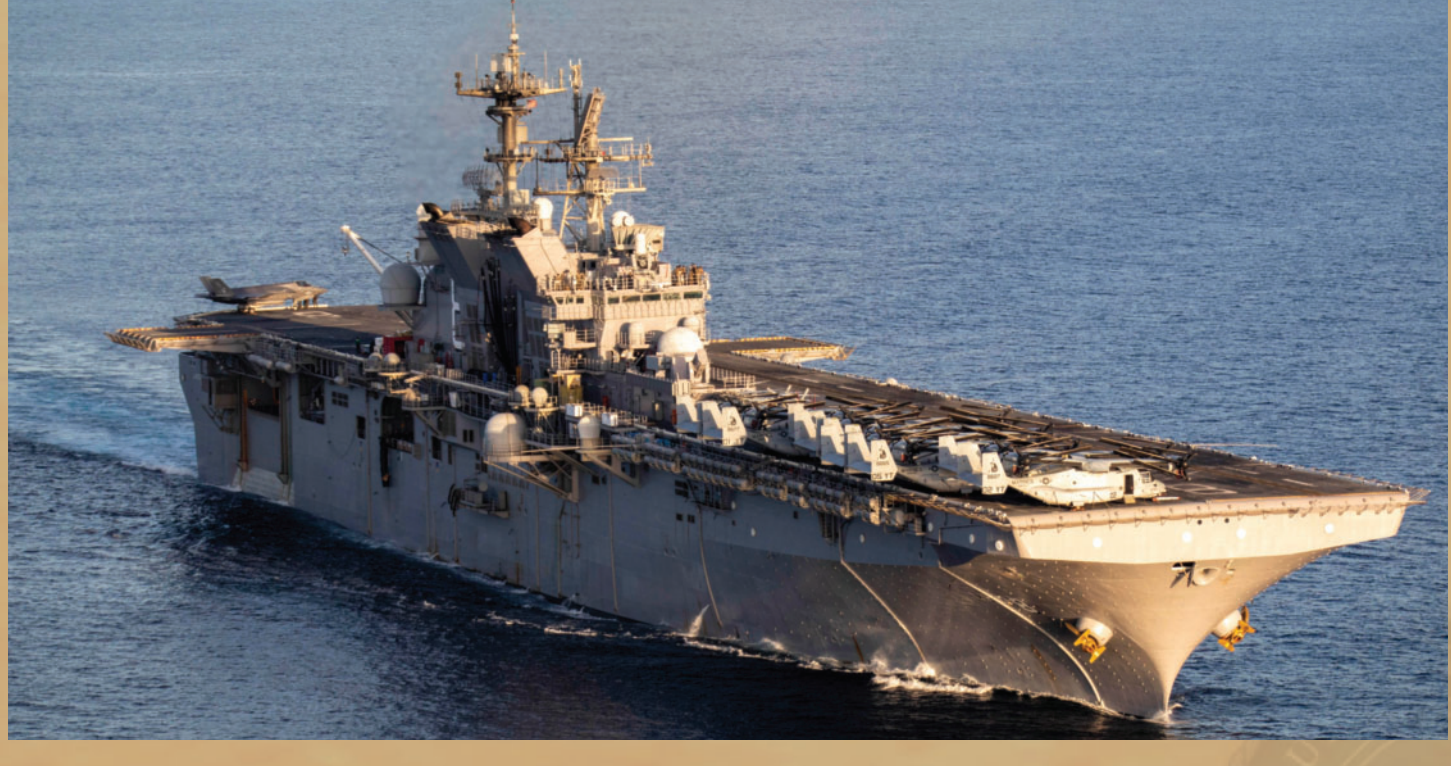
The amphibious assault ship USS Makin Island (LHD 8), flagship of the Amphibious Ready Group along with the 15th Marine Expeditionary Unit conduct operations in support of Operation Octave Quartz. The mission of OOQ is to relocate U.S. DOD forces in Somalia to other East Africa operating locations while maintaining pressure on violent extremists and supporting partner forces.