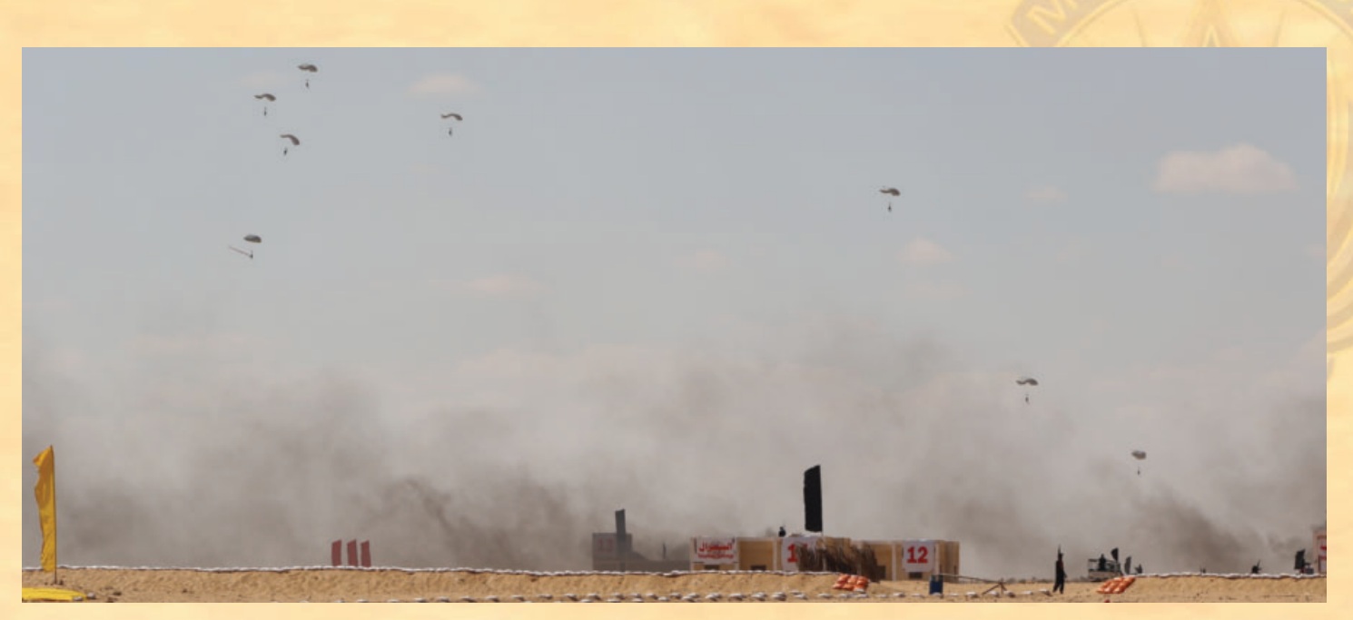
U.S. and partner nations' Special Operations Forces perform airborne infiltration onto a small village during Military Operations in Urban Terrain training at Bright Star 21, Sept. 15, 2021, in Mohamed Naguib Military Base, Egypt.

equipment and SOF on the ground to have a successful execution for Bright Star 21. We had more SOF on the ground than in 2018."