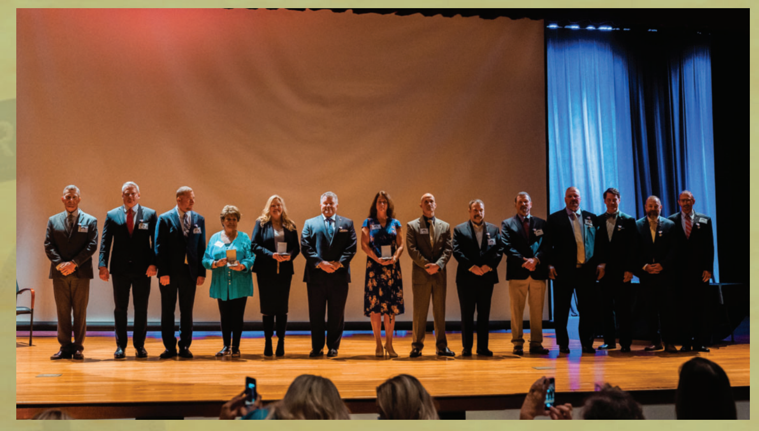
Ten Rangers from the Battle of Mogadishu and three Rangers' family members pose for a group photo following the Operation Gothic Serpent Upgrade Awards Ceremony Oct. 1, 2021, at Fort Benning, Georgia.

For the heroic actions of 18 U.S. Army Rangers, the Silver Star Medal was awarded on Oct. 1, 2021, at a