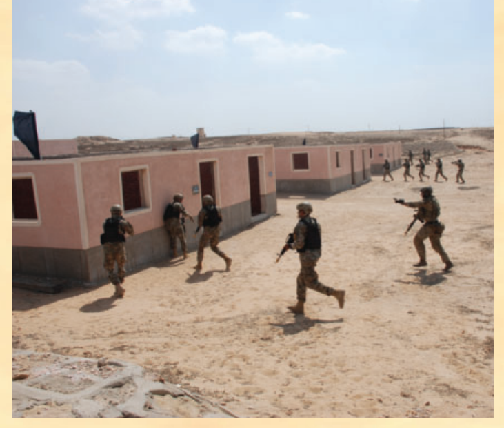
U.S. Special Forces and Egyptian Airborne Forces prepare to breach a door upon entering a military operations in urban terrain village during their culmination exercise of a joint combined exchange training in Cairo, Egypt, Aug. 31, 2021. JCETs increase interoperability with partner nations and strengthens stability in the U.S. Central Command's area of operations.

The other U.S. Special Forces team trained with the Egyptian Counter Terrorism team on close quarter battle drills, military planning, reconnaissance and infantry tactics. At the end of their JCET, they also conducted a culmination exercise where they infiltrated and exfiltrated the area after entering and clearing a building using close quarter battle skills they honed during the JCET.