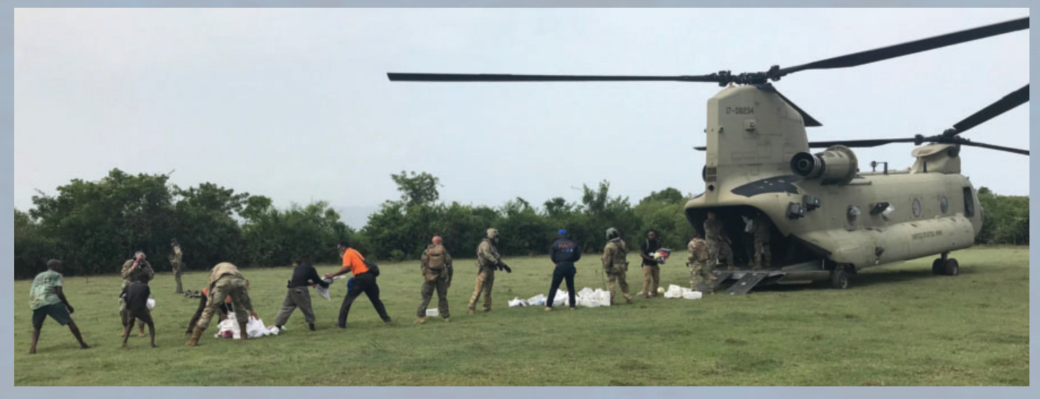
U.S. Air Force Special Tactics operators and other members of Joint Task Force-Haiti deliver humanitarian aid supplies to a remote part of the country. Special Tactics Airmen responded to a request to augment relief efforts in Haiti after a 7.2 magnitude earthquake hit the country Aug. 14, 2021.

Special Tactics Airmen train constantly to execute global access, precision strike, personnel recovery and battlefield surgery operations across the spectrum of conflict and crisis. As experts in air-ground integration, ST Airmen can assess, open, and control major airfields to clandestine dirt strips as well as lead complex rescue operations in any environment.