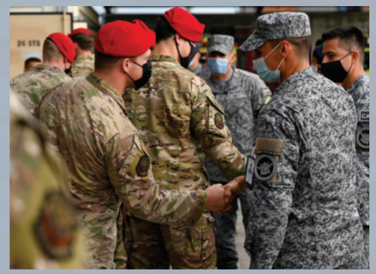
U.S. Air Force Special Tactics operators from the 24th Special Operations Wing greet their Colombian Air Force counterparts Aug. 29, 2021, before the start of events at Ángel de los Andes Cooperación VII in Rionegro, Colombia. Ángel de los Andes is a Colombian-led search and rescue exercise, while Cooperación VII is a multinational humanitarian aid and disaster response exercise. Special Tactics Airmen are Air Force Special Operations Command's tactical air ground integration force leading global access, precision strike, personnel recovery and battlefield surgery operations.