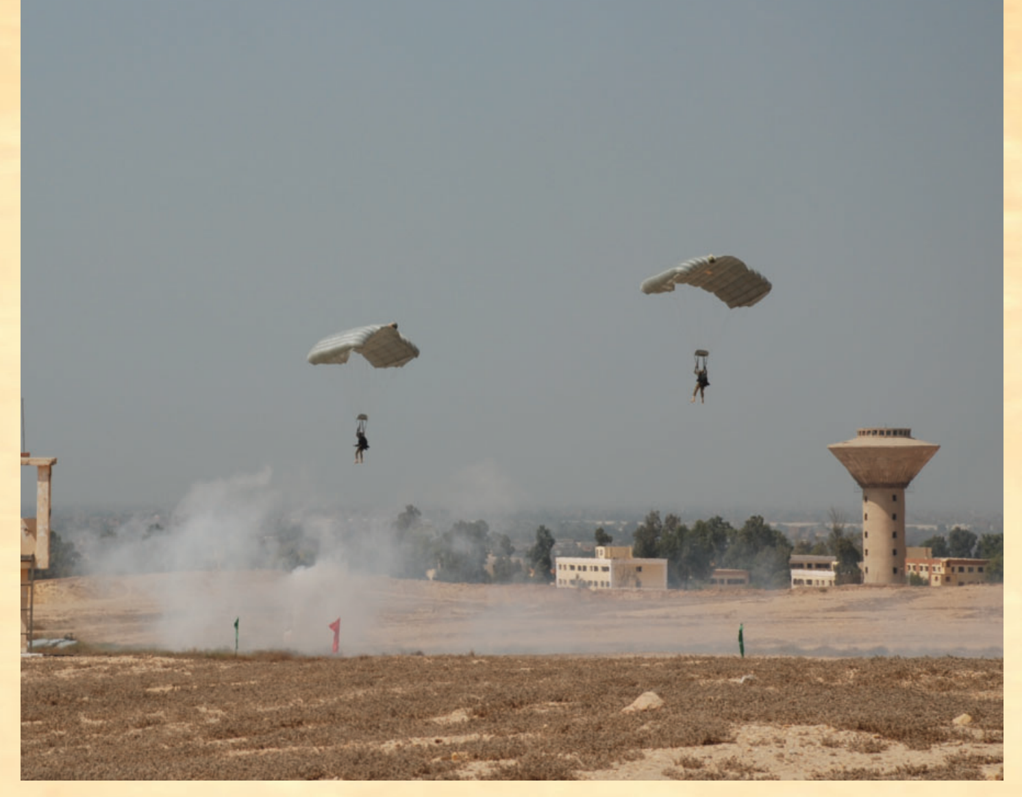
U.S. Special Forces and Egyptian Airborne Forces infiltrate via military free fall into a military operations in urban terrain village during their culmination exercise of a joint combined exchange training in Cairo, Egypt, Aug. 31, 2021. JCETs increase interoperability with partner nations and strengthens stability in the U.S. Central Command's area of operations.

nations by increasing capability and proficiency within the U.S. Central Command's area of operations.